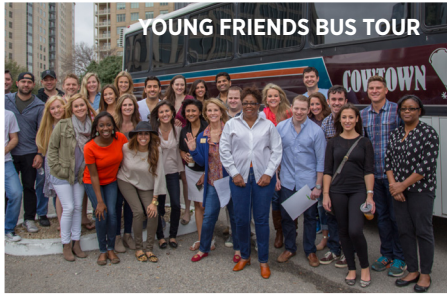
YOUNG FRIENDS BUS TOUR