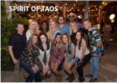
SPIRIT OF TAOS